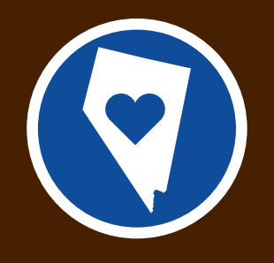
MADE IN NV