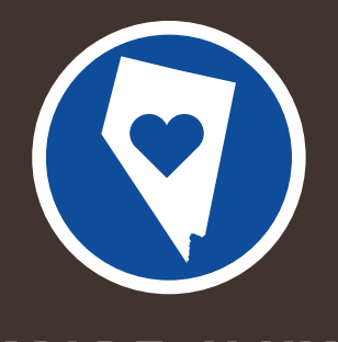
MADE IN NV